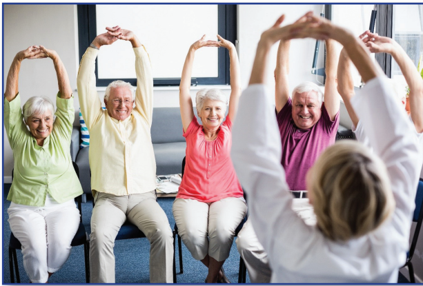
Planned recreation to engage bodies and minds.