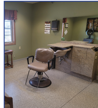
Our facility features a complete in-house salon.