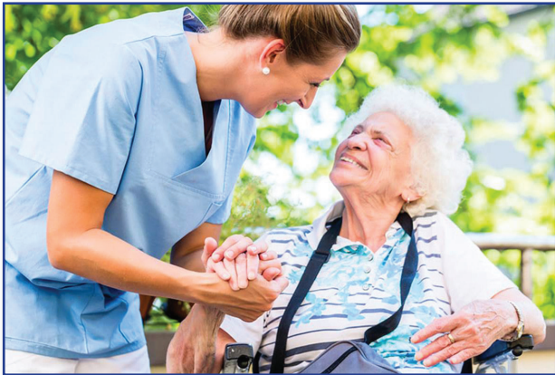
Community Memorial Assisted Living provides tenants with access to 24-hour trained staff on site.