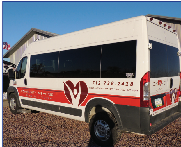
Assisted Living tenants are provided transportation services with our easily accessible van.