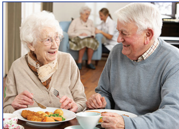
Tenants are provided three choice meals each day.