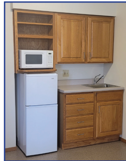
Kitchenettes come with appliances included.