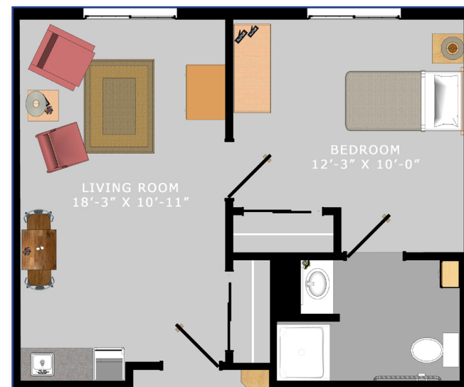
Design A – 445 sq. ft

Each room comes with a kitchenette and appliances included